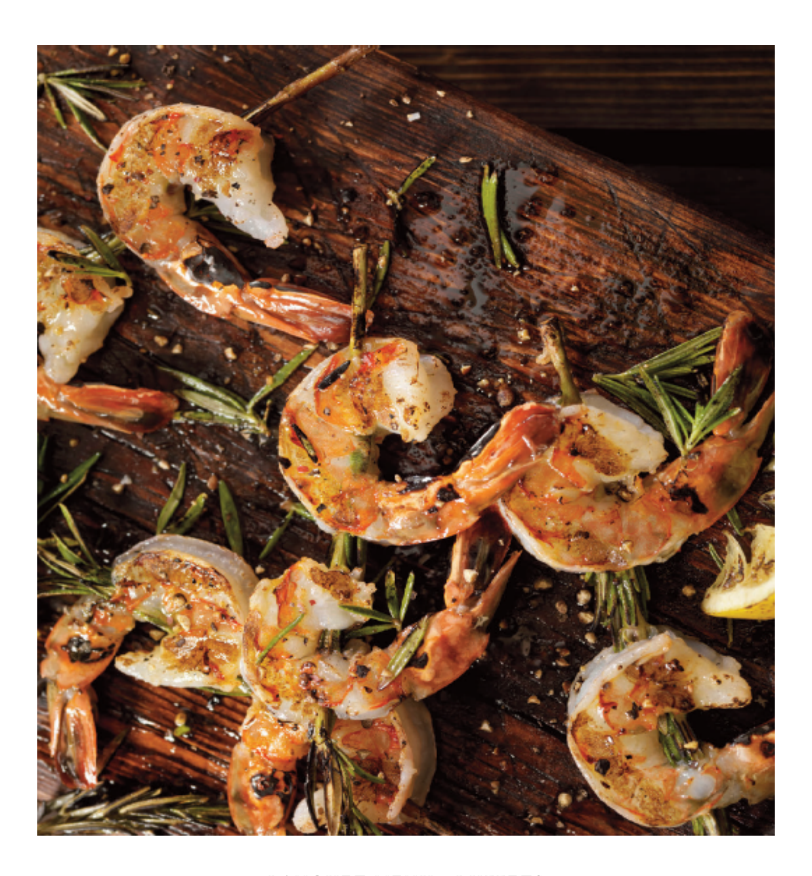
BANQUET MENU - BUFFETS