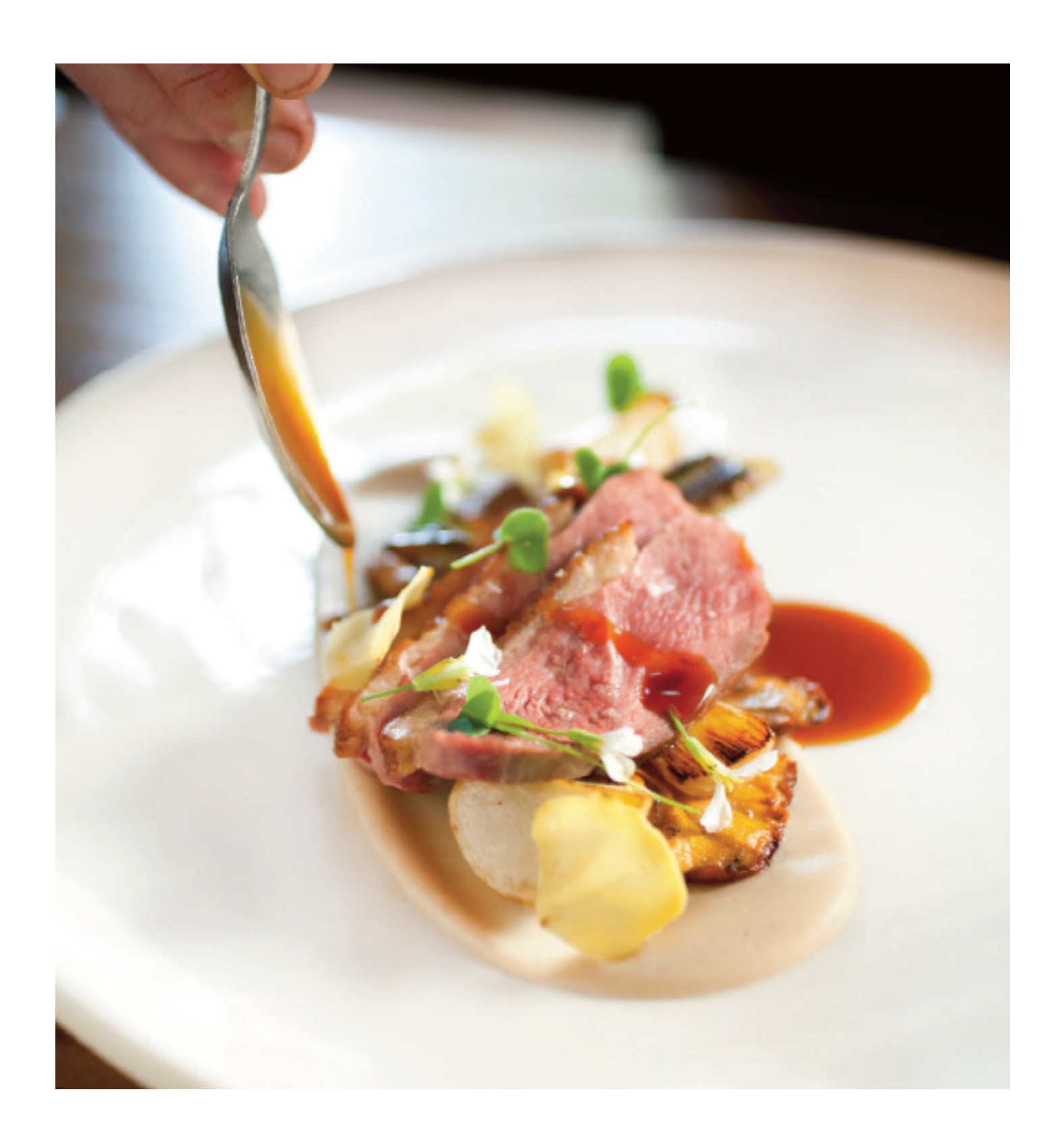
BANQUET MENU - PLATED MENU