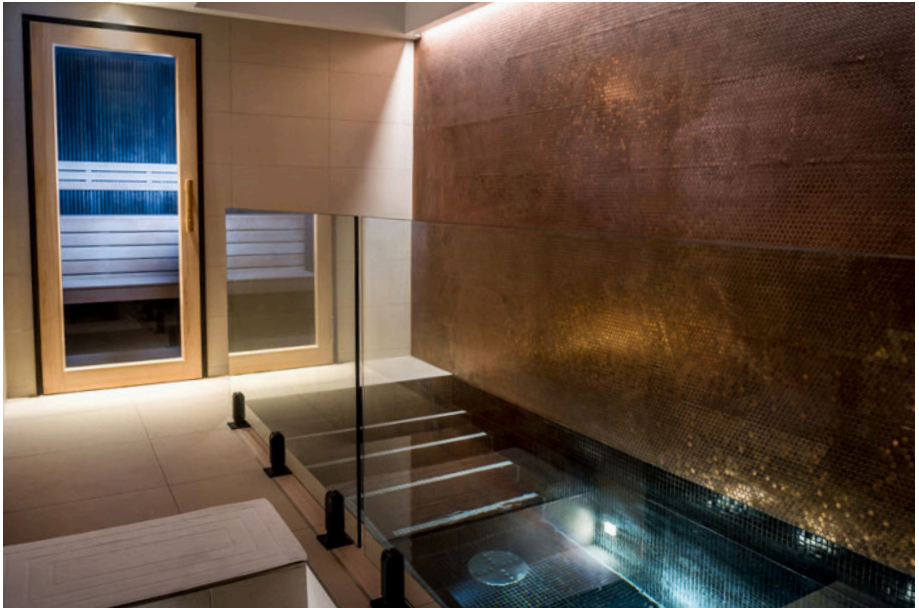
Spa Oasis Experience

We kindly recommend booking in advance as this is a popular experience.