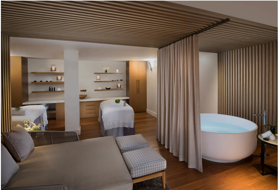
Bamboo Loft Hayman Spa

Elevate your spa experience with exclusive access to Hayman Spa's private Bamboo Loft. Unwind in your own secluded sanctuary featuring a private steam room, aromatic soaking bath and relaxation day bed before your treatment begins. Refreshments and sparkling wine are served to enhance the experience.